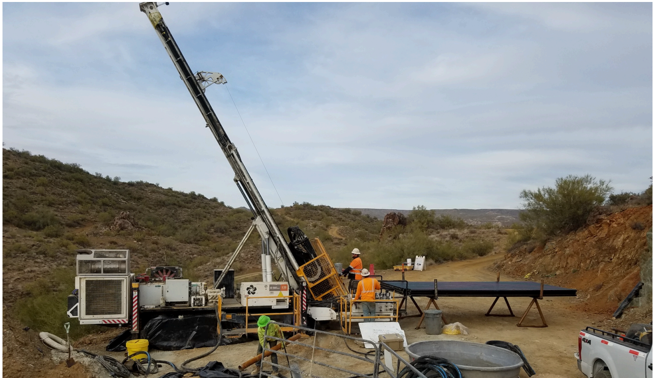
Figure 1. Drill rig turning at start of Kay Mine Phase 2 expansion program (Jan 6, 2021)

Marc Pais, CEO, commented “We are pleased to have commenced the Phase 2 drill program, which we believe has the potential to significantly expand the scope and scale of the Kay project, well beyond the boundaries of the 5.8 million tonne historic estimate* outlined by Exxon Minerals in 1982. Our successful Phase 1 drill program greatly increased our confidence in the model. Drilling encountered massive sulphides in 19 of 20 holes. Recently completed spectral alteration analyses of the Kay Mine Phase 1 program drill core, along with downhole EM geophysical surveying, has given us an even stronger understanding of the folding of the Kay deposit at depth. This work has identified a number of high priority drill targets, which we believe have the potential to host additional VMS lenses, as well as wide mineralized hinge zones, similar to the 43 m of 3.9% CuEq (incl. 15 m of 6.7% CuEq) encountered in hole 13.”