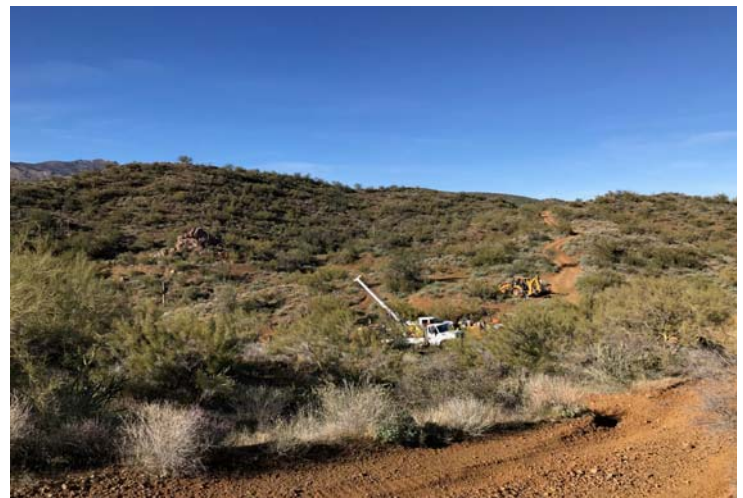
Drill rig located on Pad 1 at Kay Mine Claims

For additional information, please contact the CEO at: